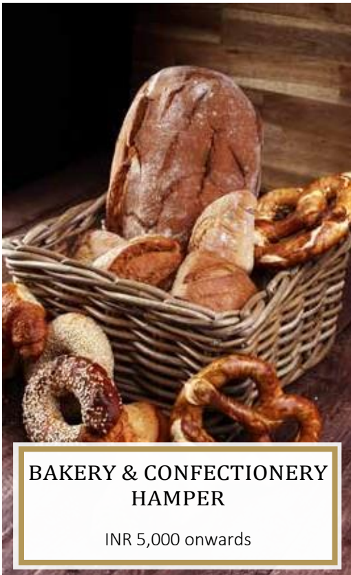
BAKERY & CONFECTIONERY HAMPER

Hospitality @ Stay Home | Hospitality @ Work From Home